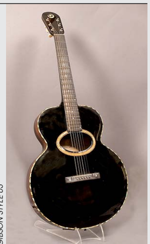
GIBSON STYLE 03

as were built Orville's style 03: hand carved out of two solid slab of wood, spruce for the top & mahogany for the back (most of Orville's were in walnut).